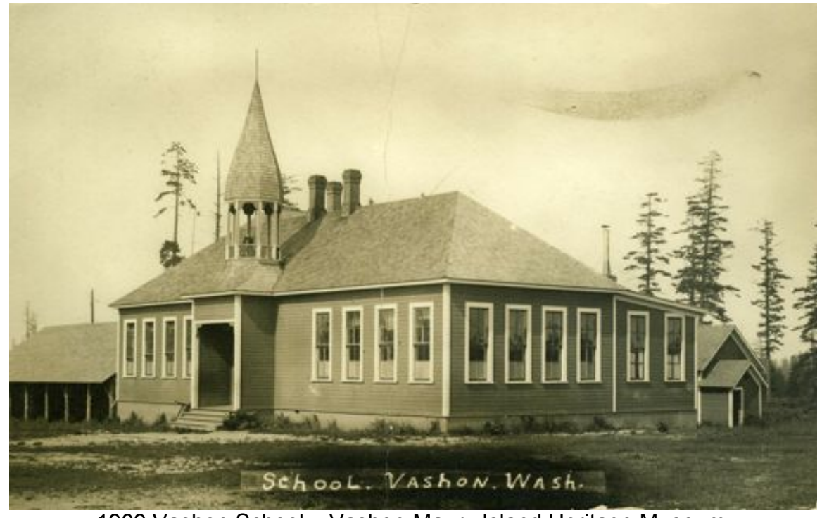
1909 Vashon School

Vashon Park District's Ober Park has long been a center for the Vashon community. The land was originally purchased 1884 by John Blackburn an early Vashon Postmaster and the first elected legislator to the Washington Territorial Legislature from Vashon. In 1886 Blackburn donated the land to the newly formed Vashon School District and in 1887 the Vashon School was built on the site. A new school was built in 1908, and the first school building behind the "new" school was used for storage. The original photo of the "new" Vashon School was taken in 1909.