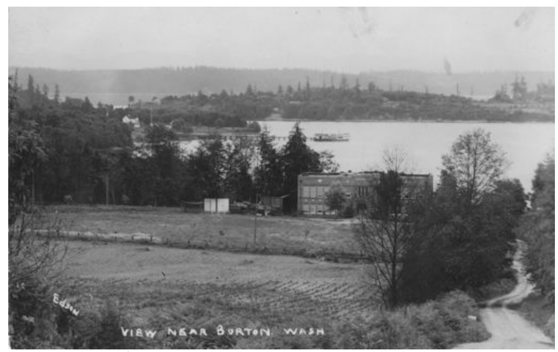
Burton Union High School by Norman Edson: courtesy Vashon-Maury Island Heritage Museum

Vashon High School was built in 1913 when the Vashon and Vermontville (Glen Acres area) School Districts combined to construct a new building north of Vashon town on the main highway where Vashon Elementary School was later located and where The Harbor School now sits. This school was a three-story building that was also used as a grammar school and had a separate wooden gymnasium added in 1914. The Vashon High School with Gymnasium photograph shows the school and gymnasium in the 1930s when it was the Vashon Grade School.