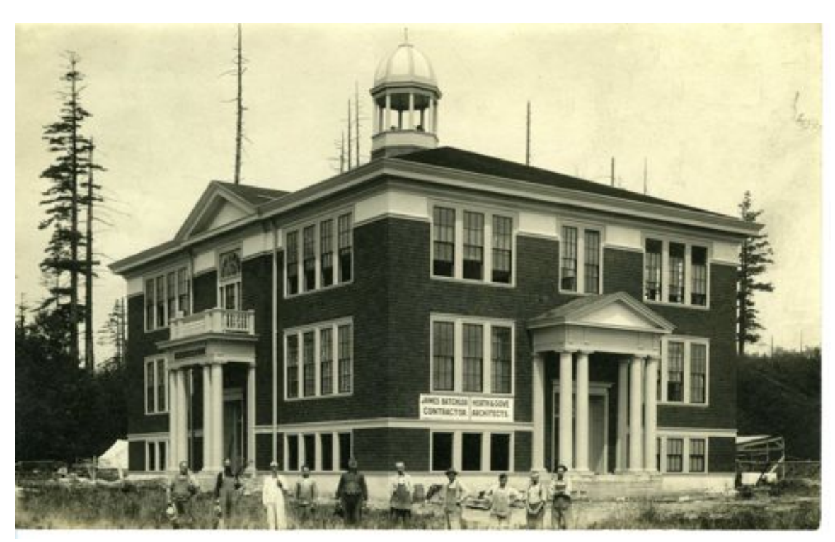
Vashon High School under construction