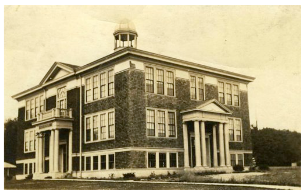
Vashon High School: courtesy Vashon-Maury Island Heritage Museum