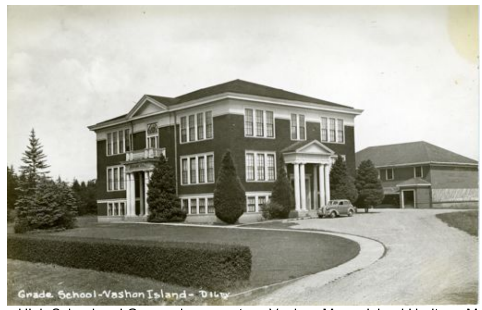
Vashon High School and Gymnasium: courtesy Vashon-Maury Island Heritage Museum

Vashon High School was built in 1913 when the Vashon and Vermontville (Glen Acres area) School Districts combined to construct a new building north of Vashon town on the main highway where Vashon Elementary School was later located and where The Harbor School now sits. This school was a three-story building that was also used as a grammar school and had a separate wooden gymnasium added in 1914. The Vashon High School with Gymnasium photograph shows the school and gymnasium in the 1930s when it was the Vashon Grade School.