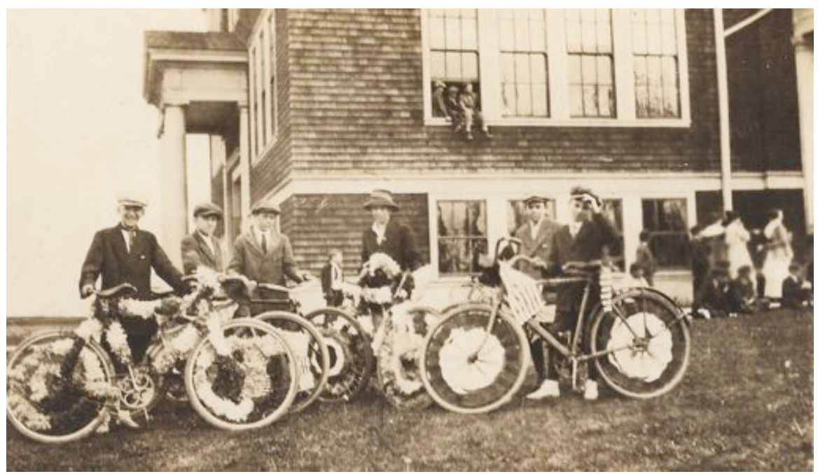
Vashon High School