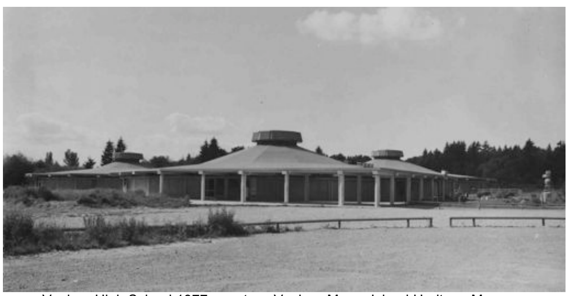
Vashon High School 1977: courtesy Vashon-Maury Island Heritage Museum

Vashon Islanders have built a new high school and demolished the old one roughly every 40-50 years. Now that we passed the $47.7 million bond issue in February, 2011 it appears that we're maintaining that construction timeline. The "new" Vashon High School opened in 2014.