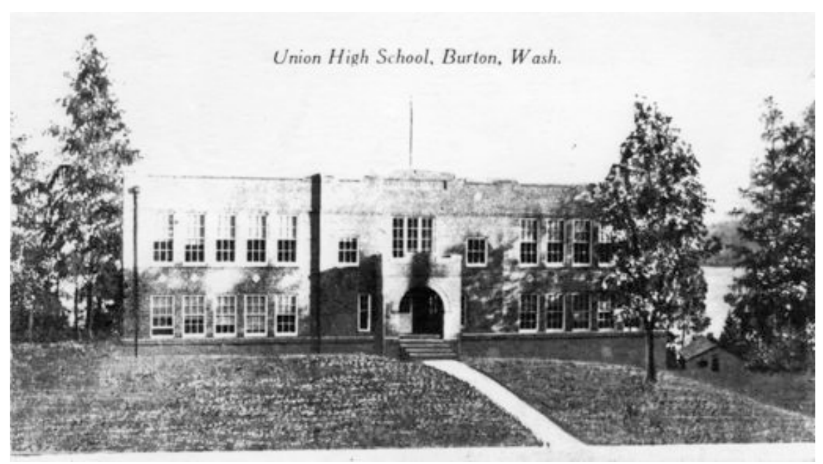
Burton Union High School by Norman Edson: courtesy Vashon-Maury Island Heritage Museum