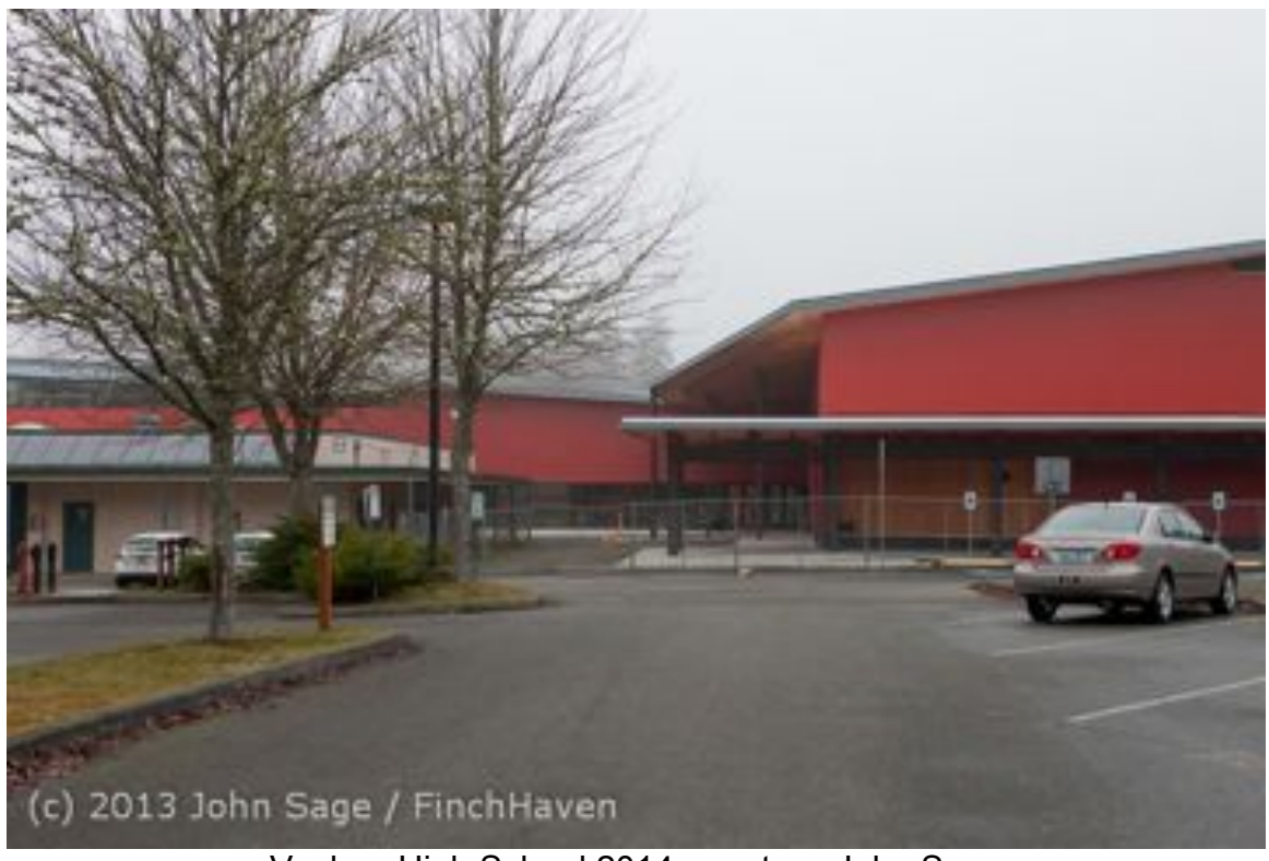
Vashon High School 2014