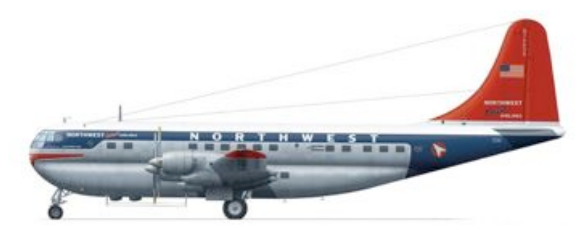
Drawing: Courtesy of Simon Glancey

On April 2, 1956, Northwest Oriental Airlines flight No. 2 took off from Seattle-Tacoma International Airport on its regularly scheduled flight to Portland and then on to Chicago and New York. The Boeing 377 Stratocruiser was a double-decked four-engine airplane that seated 50-60 passenger, and had a lounge where drinks were served on the lower deck. The plane had originally been designed as a military transport and was converted to civilian airline use by pressurizing and air conditioning the cabin.