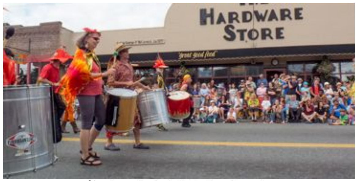
Strawberry Festival, 2012. Terry Donnelly The Festival Parade and crowds fill Main Street in Vashon Town

During World War II, the festival was suspended to support the war effort. After the war, the festival was restarted in 1946 when its name was changed to the Peach Festival, as peaches had become an important crop. The peach blight in 1948 and 49 ended that short run, and in 1949 it was called the Vashon Festival, until it changed to the Harvest Festival in 1951, and then from 1952 until 1983 it was named the Island Festival. In 1958, the Vashon Chamber of Commerce was prepared to drop its support of the Island Festival because of a "lack of enthusiasm" for the event. However, cooler heads prevailed and the Jaycees sponsored the Island Festival until it was renamed the Strawberry Festival in 1984, which it has remained ever since.