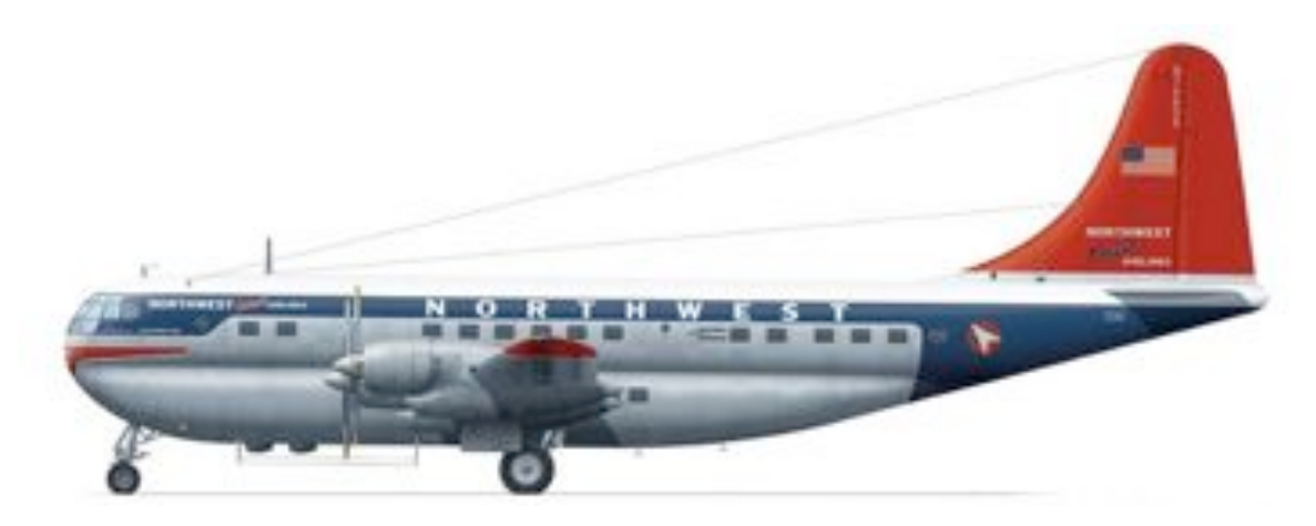
Drawing: Courtesy of Simon Glancey

On April 2, 1956, Northwest Oriental Airlines flight No. 2 took off from Seattle-Tacoma International Airport on its regularly scheduled flight to Portland and then on to Chicago and New York. The Boeing 377 Stratocruiser was a double-decked four-engine airplane that seated 50-60 passenger, and had a lounge where drinks were served on the lower deck. The plane had originally been designed as a military transport and was converted to civilian airline use by pressurizing and air conditioning the cabin.