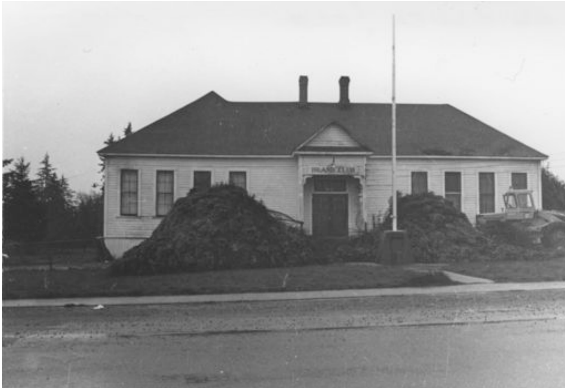
1950 Island Club – Vashon-Maury Island Heritage Museum

function for the next 50 years. With the construction of the new Vashon Union High School in 1930 and its new auditorium, Community House use declined significantly. It continued to be used for gatherings and functioned as the theater when the old Vashon Theatre burned in early 1946 until the current Vashon Theatre was opened in May of the next year.