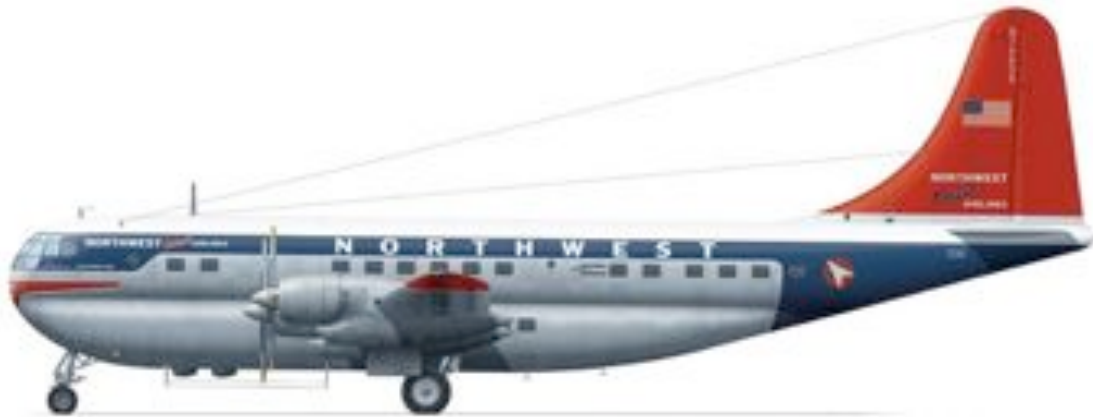
Drawing: Courtesy of Simon Glancey

On April 2, 1956, Northwest Orient Airlines flight No. 2 took off from Seattle-Tacoma International Airport on its regularly scheduled flight to Portland and then on to Chicago and New York. The Boeing 377 Stratocruiser was a double-decked four-engine airplane that seated 50-60 passenger, and had a lounge where drinks were served on the lower deck. The plane had originally been designed as a military transport and was converted to civilian airline use by pressurizing and air conditioning the cabin.