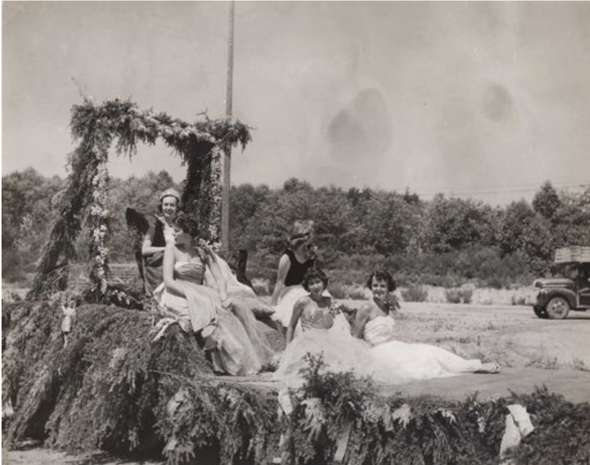
1951 Harvest Queen and Her Court